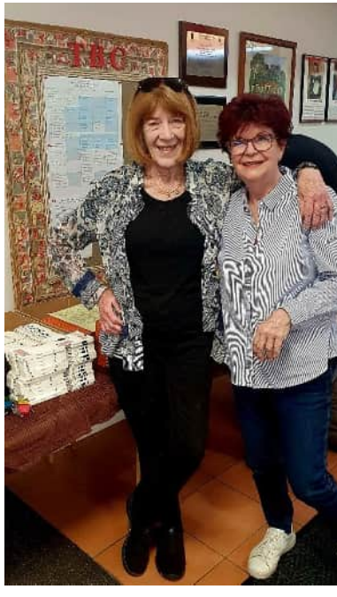
Glenys Clift Michell Alroe Not shown