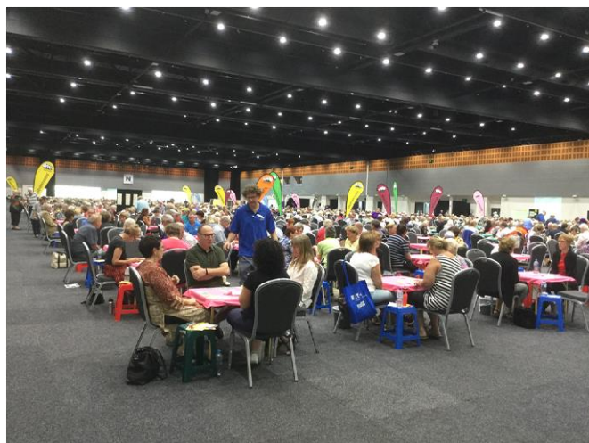
Gold Coast Congress